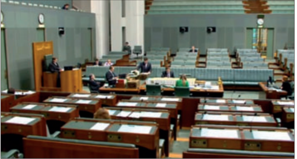
House of Representatives during the 'Debate' on the Stronger Futures Legislation