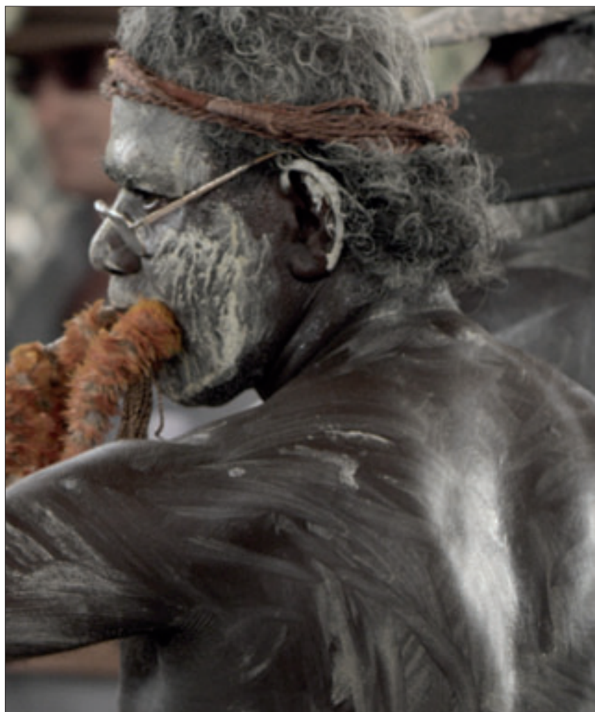
Ceremonial Dancer at the Maningrida Hearing