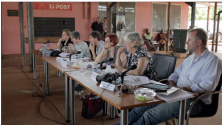
Senate Committee Senators Crossin, Moore, (staff), Siewert, Boyce and Scullion