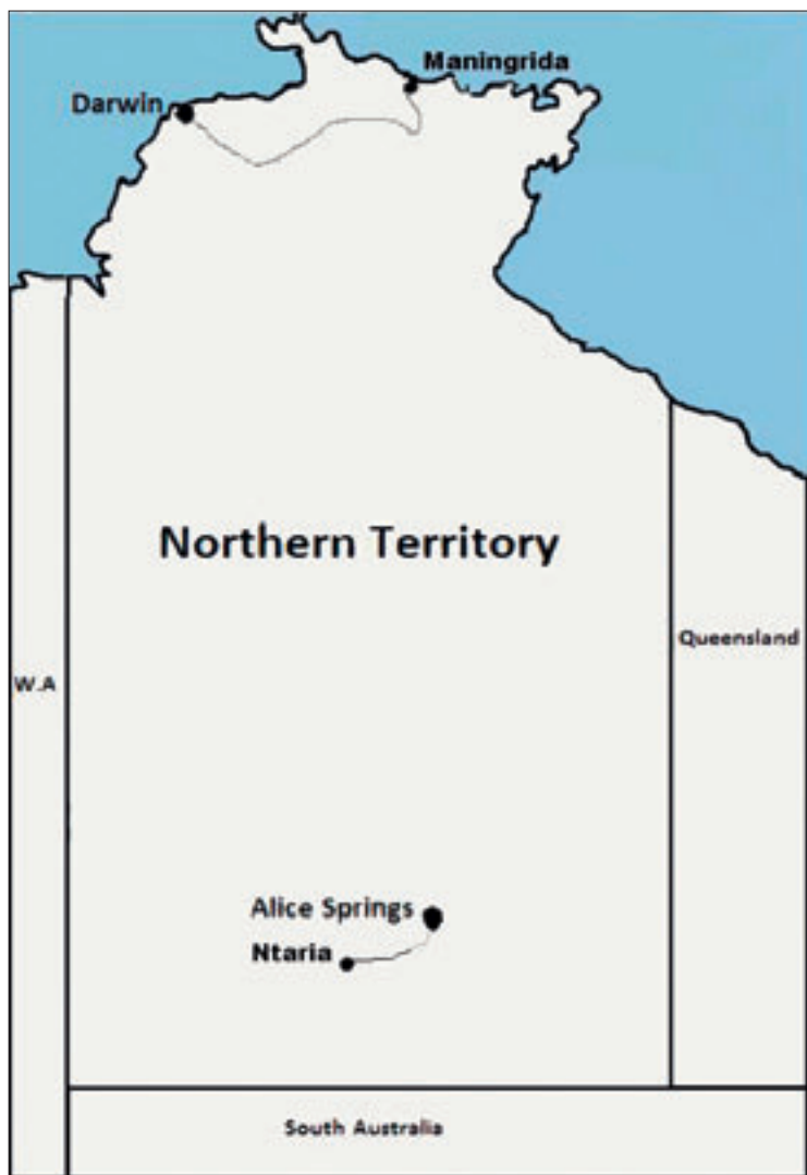
Map of the Northern Territory showing the communities of Maningrida and Ntaria