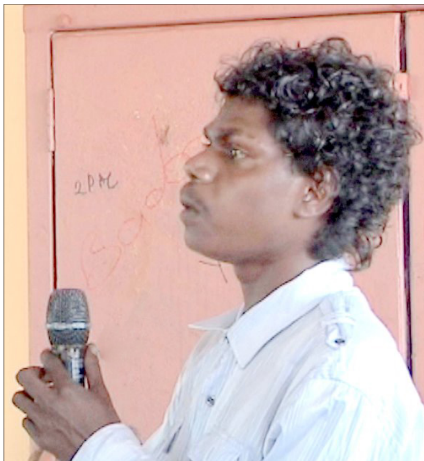
Maningrida Consultation Participant