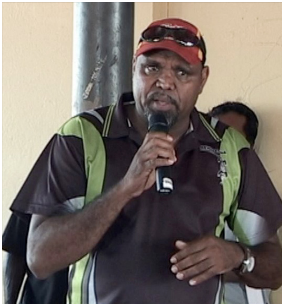
Maningrida Consultation Participant