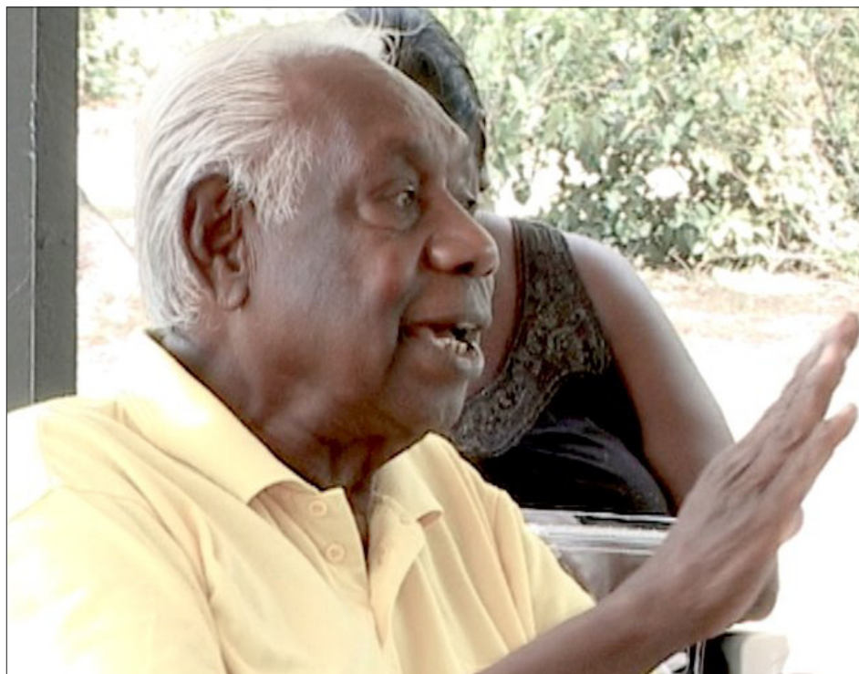
Bagot Community Consultation Participant