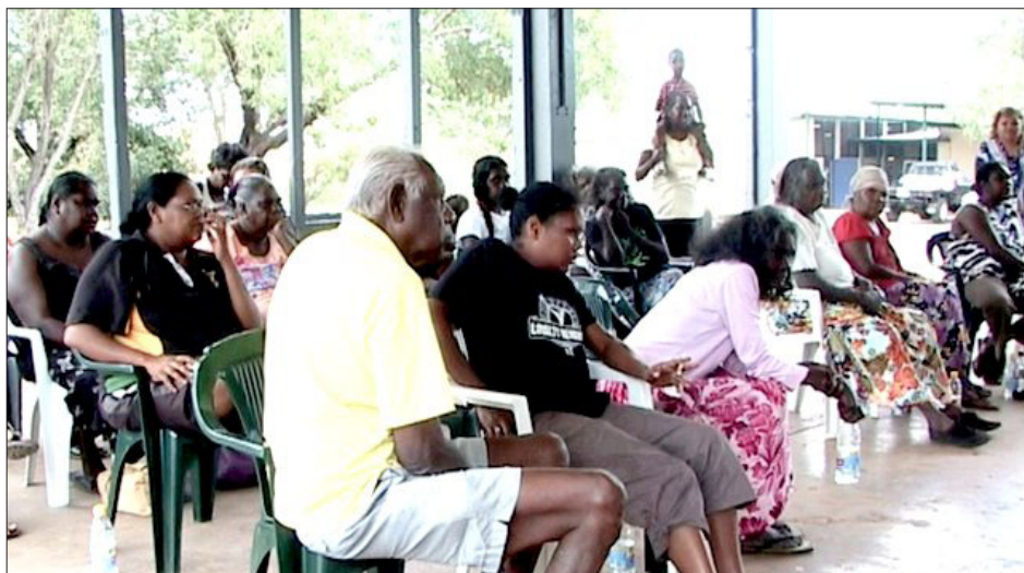
Bagot Community Consultation