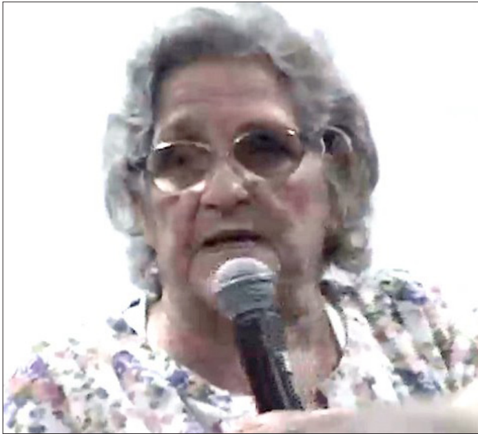
Alice Springs Public Meeting Participant