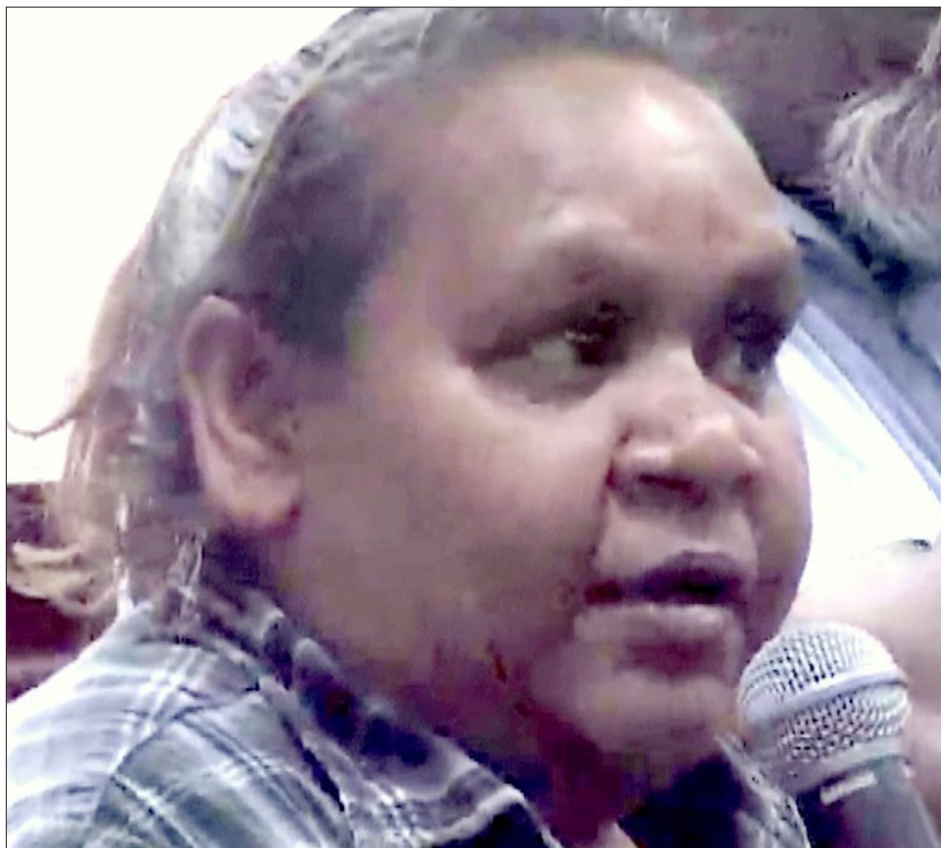
Alice Springs Public Meeting Participant