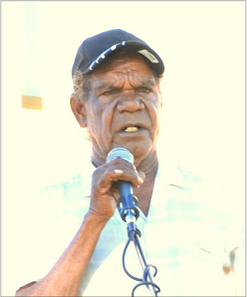
Yuendumu Consultation Participant