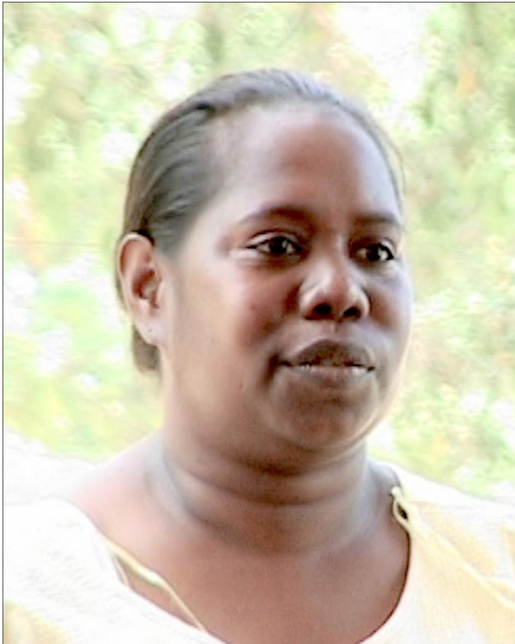
Bagot Community Consultation Participant