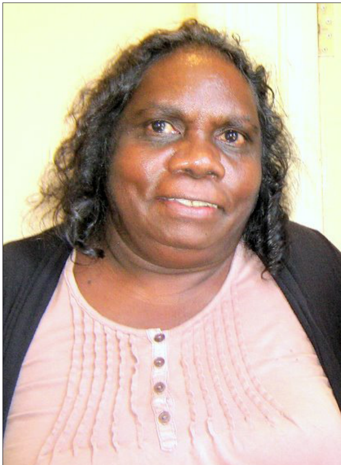
Yirrkala Consultation Participant