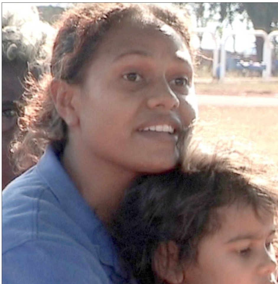
Maningrida Consultation Participant