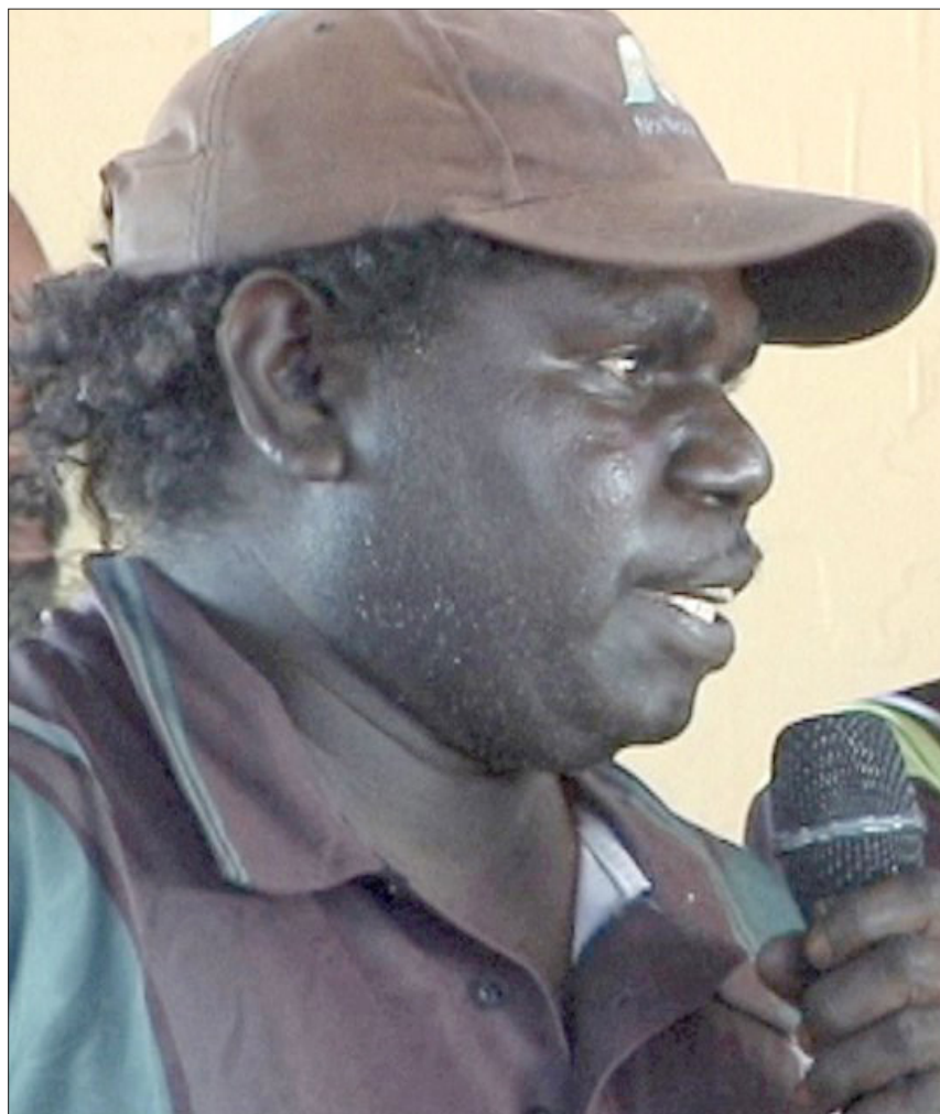
Maningrida Consultation Participant