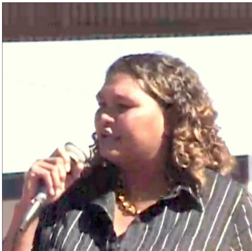
Kintore Consultation Participant