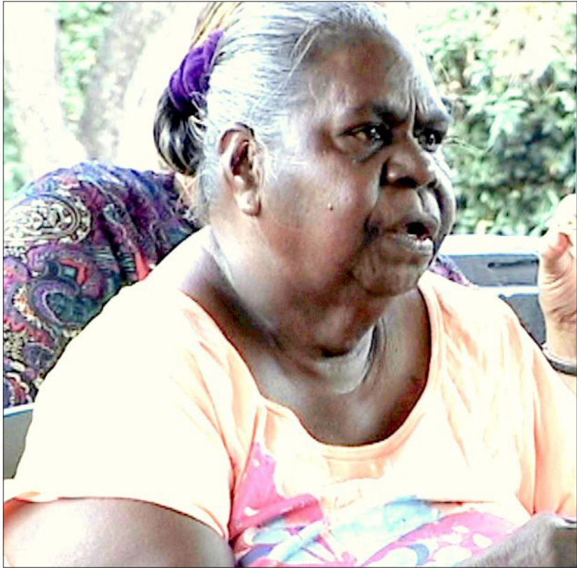
Bagot Community Consultation Participant