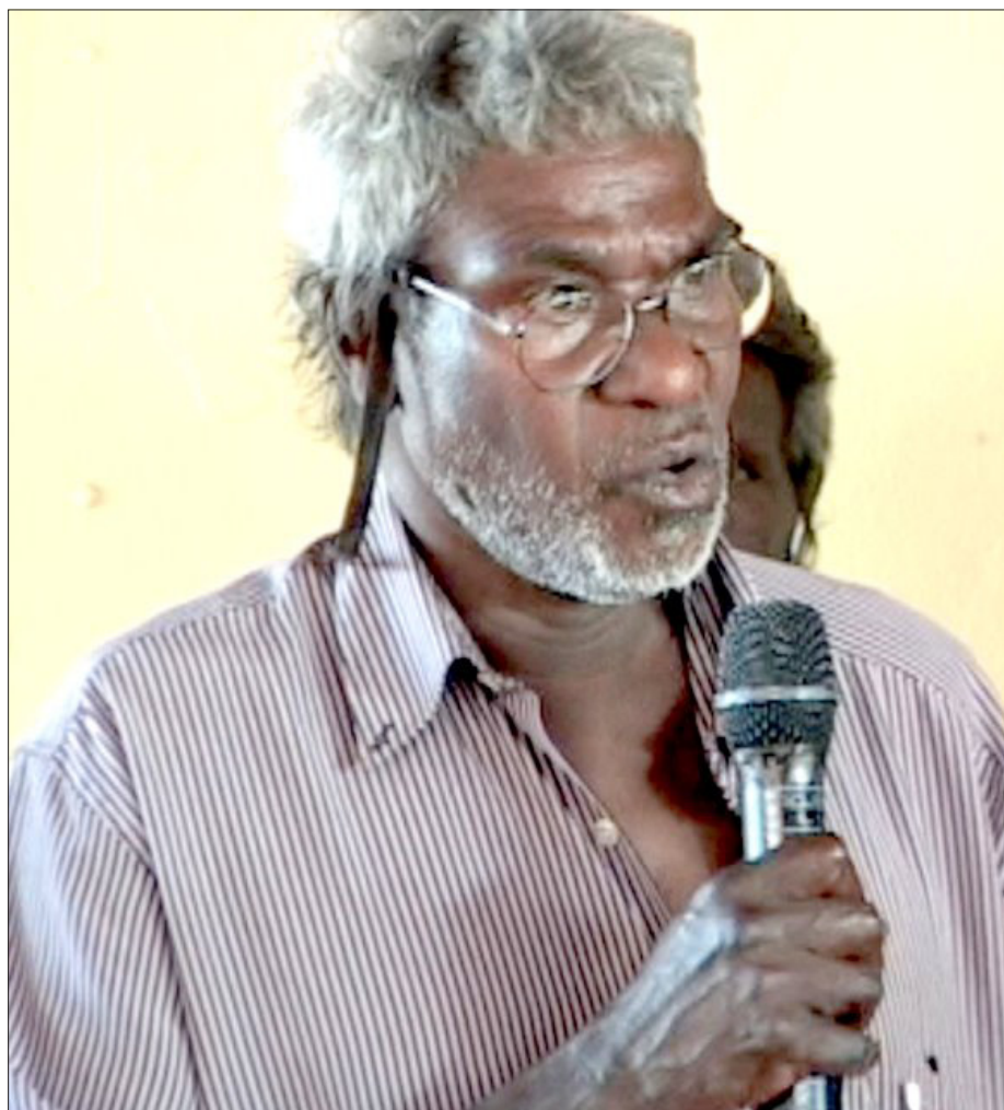
Maningrida Consultation Participant