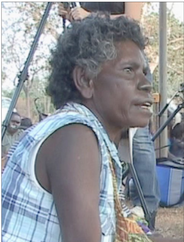
Maningrida Consultation Participant