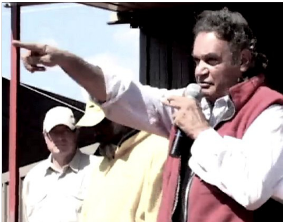
Mutitjulu Consultation Participant