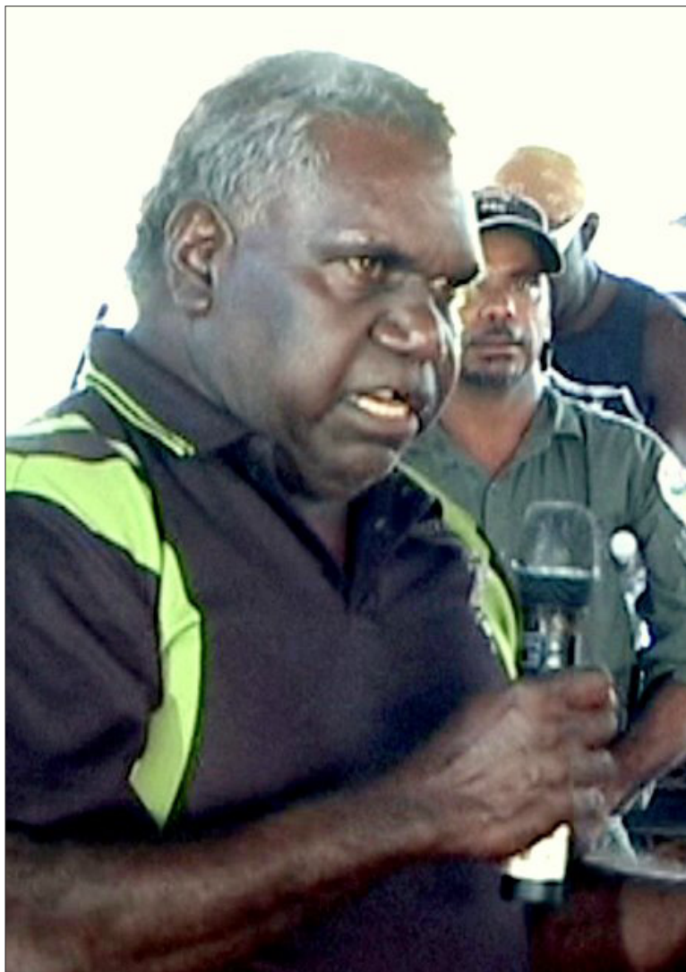
Maningrida Consultation Participant