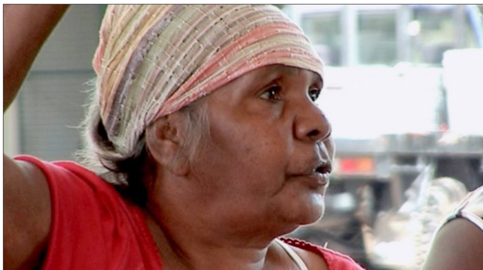
Bagot Community Consultation Participant