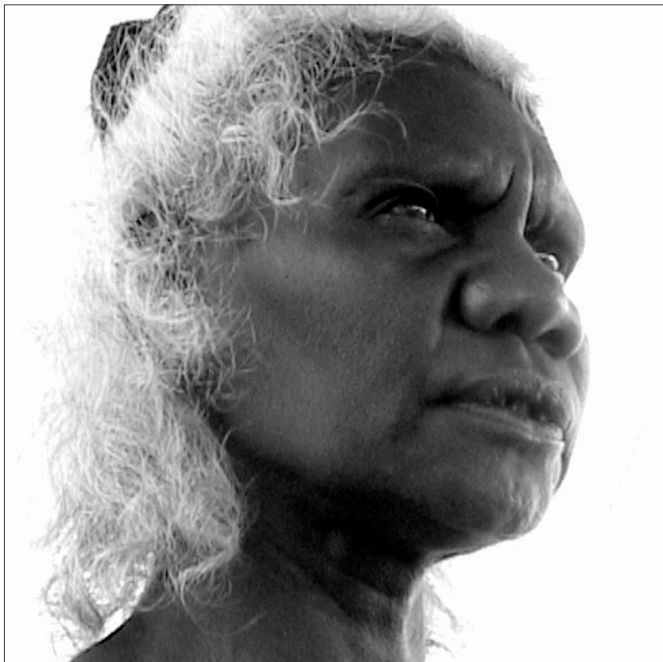
Maningrida Consultation Participant