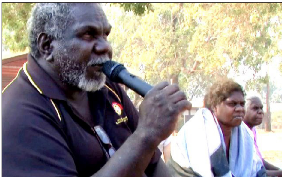
Galiwin'ku Consultation Participants