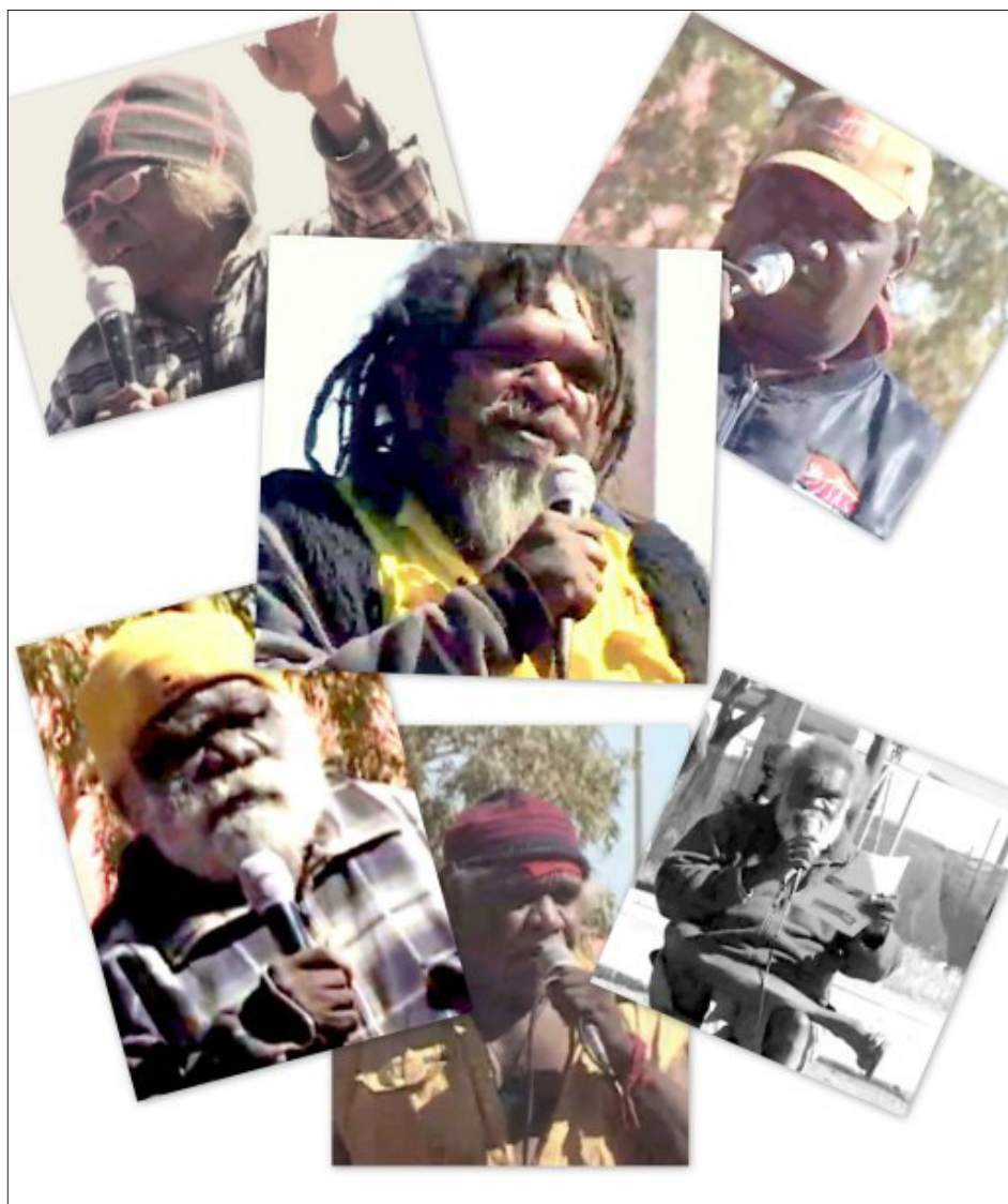
Kintore Consultation Participants