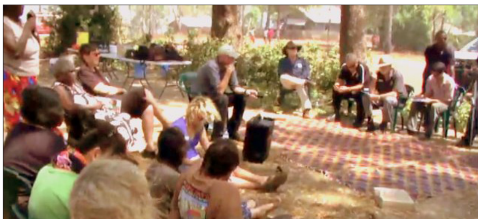
Galiwin'ku Community Consultation