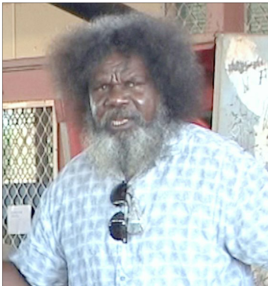
Maningrida Consultation Participant