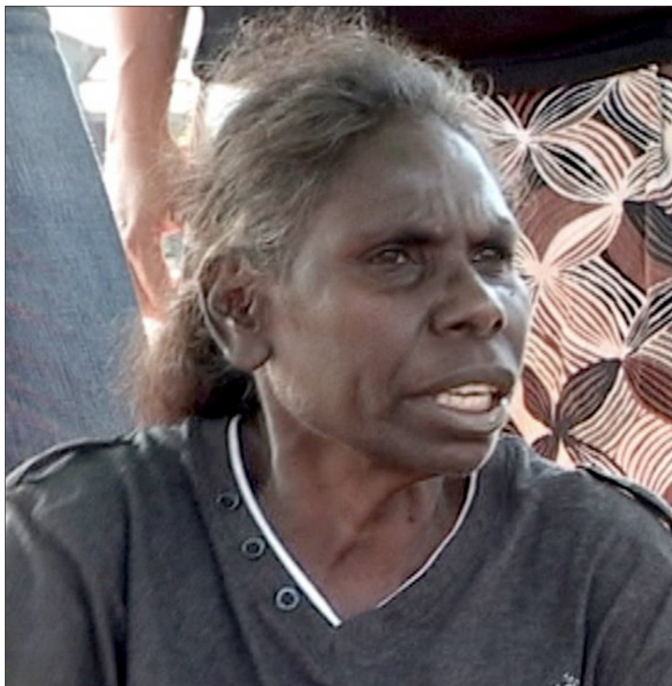
Maningrida Consultation Participant