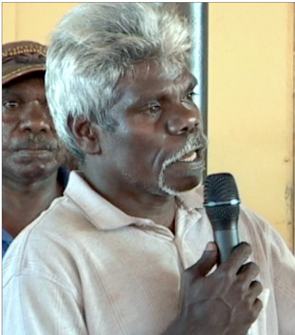
Maningrida Consultation Participant